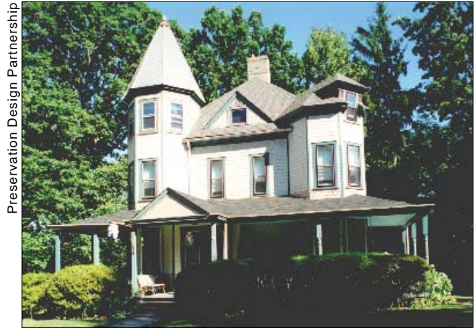
This ca. 1890, Queen Anne house is an example of the diverse architectural styles found in Cheltenham Township.

In most instances, property owners or tenants will interact with the BHAR when applying for a Certificate of Appropriateness [COA] for a proposed project at their building or site.