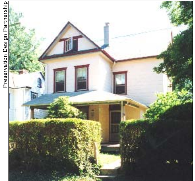
Sensitive maintenance and repairs preserve the building's character and highlight the historic features.